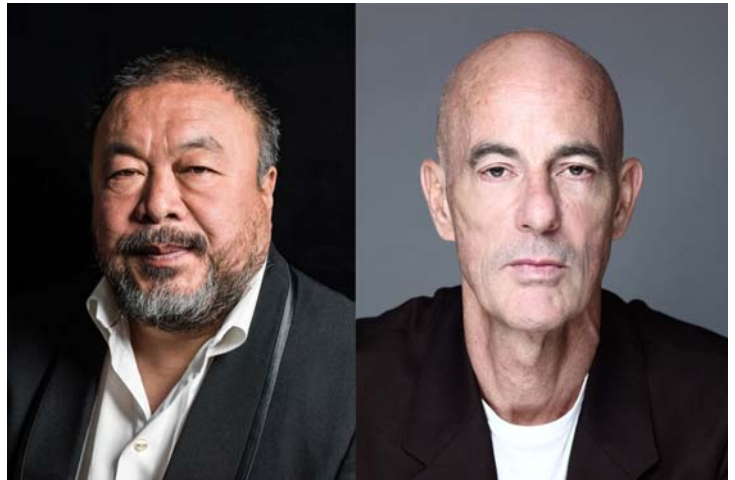
Ai Weiwei and Jacques Herzog