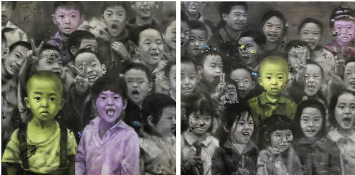
Li Tianbing, Ensemble # 1 + 2, 2008, oil on canvas, 2 panels, 200 x 400 cm, © the artist. M+ Sigg Collection, Hong Kong. By donation

'Chinese Whispers' presents some 150 pieces created by contemporary Chinese artists over the past fifteen years. The adumbration of new artistic trends and concerns is presented in two thematic sections, which are themselves split into two parts each. They illustrate artistic positions between East and West, and between tradition and progress ('Global Art from China'; 'On Dealing with Tradition'); they reflect the impact of recent sweeping changes, both on China's urban fabric, on the country's use of resources, and on how China has documented its recent history; and they explore ways in which artists caricature the political system, or engage in emotional introspection ('Traces of Change'; 'Between Consumer Mania and Spirituality').