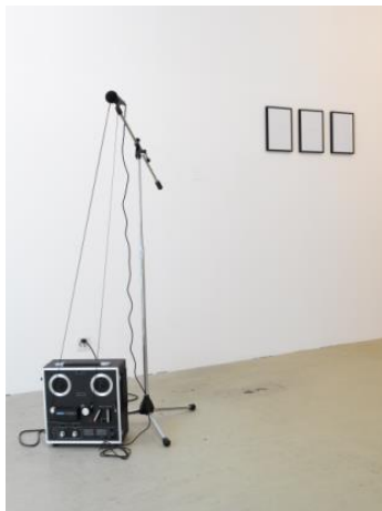
Pavel Büchler Lou Reed Live, 2008 Kunstmuseum Bern, Kunsthalle Bern Foundation

Contemporary art performance, that is, ephemeral presentations that extend over a limited space of time, is becoming increasingly important in the classical canon of art. Analogous to our digital age – which is characteristically transient and dominated by an overkill of information and sensory overload – the immaterial medium of art performance finds new paths for interpreting and staging familiar things in a new light. The Kunstmuseum Bern is exploring its collection of contemporary art with a hands-on approach. The title of our new exhibition echoes, tongue-in-cheek, the message of Queen's The Show Must Go On , the legendary pop song of this famous British group, and pays tribute to the overriding importance of performativity in contemporary art.