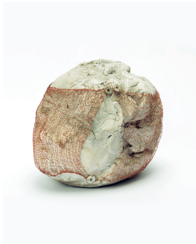
↑ Marisa Merz. Untitled , 1982, raw clay, copper wire, tacks, 17 x 16 x 22 cm, Merz Collection, photo: Renato Ghiazza ©2025, ProLitteris, Zurich

It is said of Merz that she created exhibitions that were works of art in themselves. She had the ability to transcend the visible, to transform physical spaces into spiritual ones: places of retreat, introspection and encounters with the self – or with the invisible.