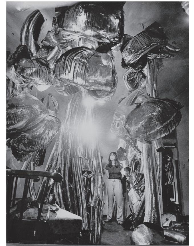
↑ Marisa Merz with Living Sculpture , Turin, 1967, Merz Collection, photo: Renato Rinaldi © 2025, ProLitteris, Zurich

Merz also explored new possibilities in the area of drawing. By combining large sheets of paper, she was able to exceed their physical limits, creating imagery that could be situated in the tradition of Italian fresco painting. The large-format drawings rapidly filled the walls of her studio. Sometimes they also contained components from other works, such as small modeled heads or copper wires. Merz tirelessly followed the properties of the materials and the spaces. She continually created new forms in new contexts. Nature and time assisted in shaping her works. Using 'poor' – simple and quotidian – materials and techniques, she created poetic works that draw the viewer in. Even during her late period, her work remains complex and extremely open, enabling a wide range of ways of approaching and interpreting it.